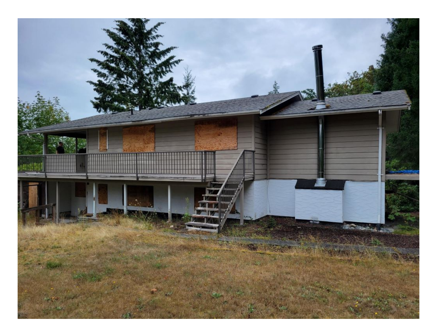
See the listing online at <a href="https://www.nickelbros.com/residential/homes/the-churchill/">https://www.nickelbros.com/residential/homes/the-churchill/</a>.

Price includes house with local delivery and lowering onto foundation. Prices may vary based on final location, site accessibility, utility line work involved and/or barging requirements.